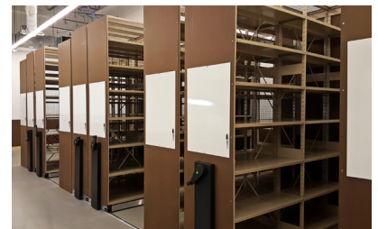
Mechanical-Assist Mobile System