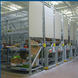
RTA Furniture & Appliance Storage