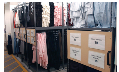
Manual Mobile System