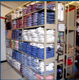
Fold & Hang Apparel Storage