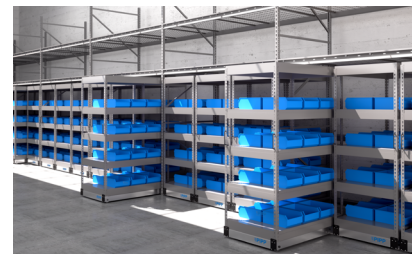
Under-Rack Mobile Systems