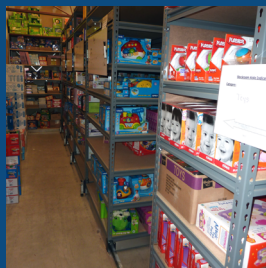
Small Box Storage