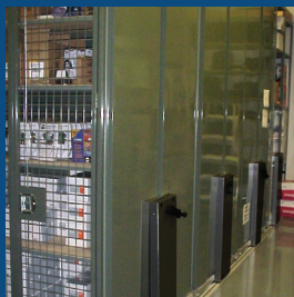
Secured Electronics Storage